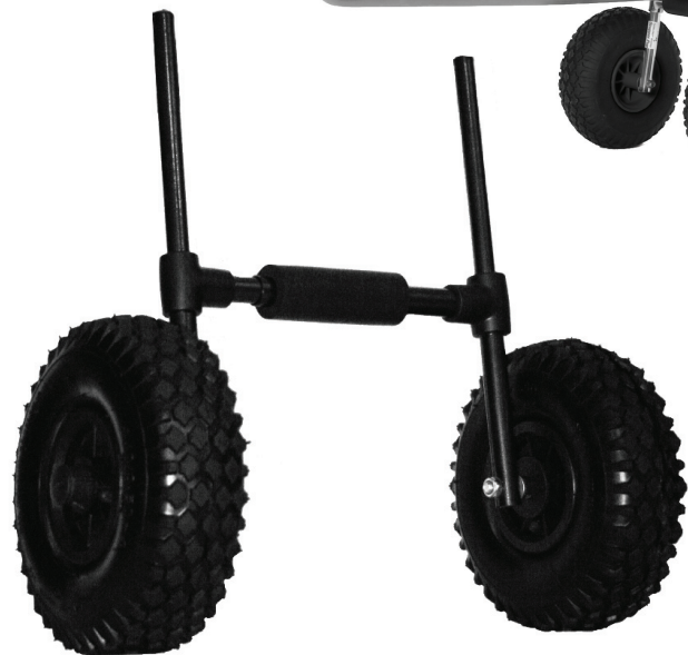
Slide crossbar tubes together, leaving foam padding on bars.

To hold tubes in position, allow snap button to emerge from one of the holes in crossbar. Some holes may be hidden beneath foam padding.