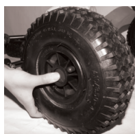
push axle through