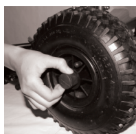
press down to clear wheel hub